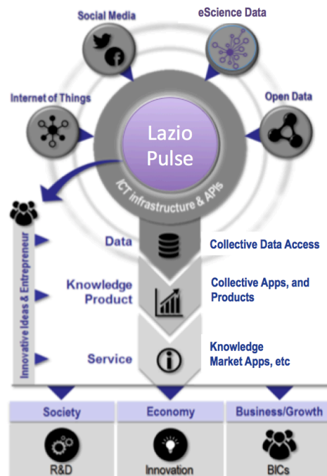
Fig 2: Fig 2: Schematic view of Lazio Pulse scientific and social benefits developed through the use of Open Data of different organisations through The Earth Lab. © ESA/PPM.